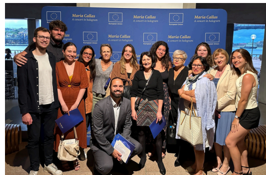
Maria Callas: A concert in Hologram