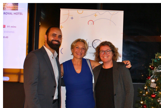
Journée Internationale des professeurs de français in partnership with NAFT