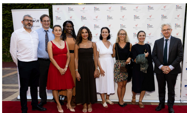
Our friends from the International French school