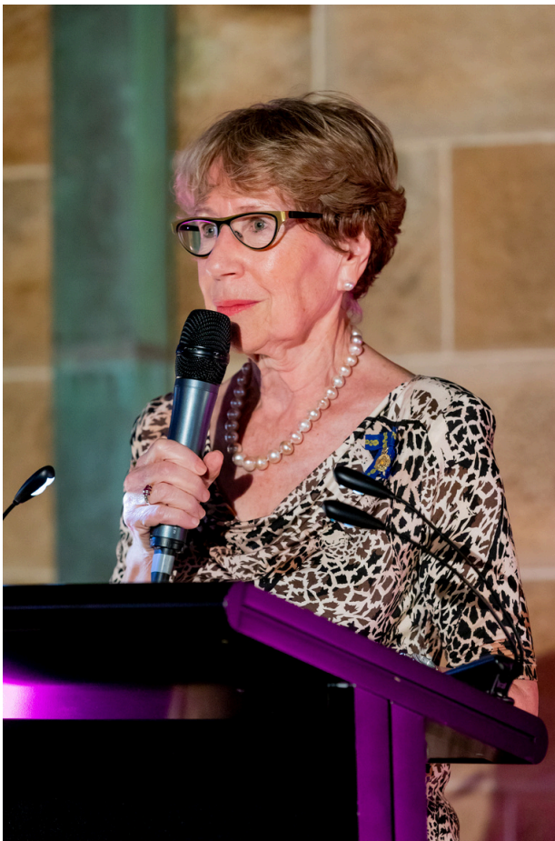
Her Excellency the Honourable Margaret Beazley AC KC