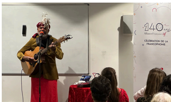
New Caledonia Short Film Festival - Gulaan concert