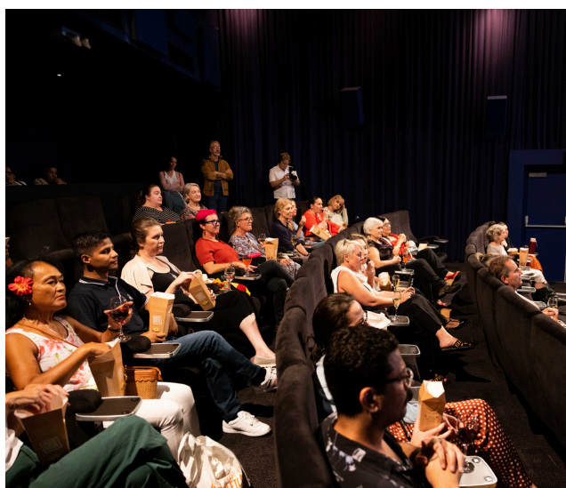
NSW Nurses and Midwives at Palace Verona